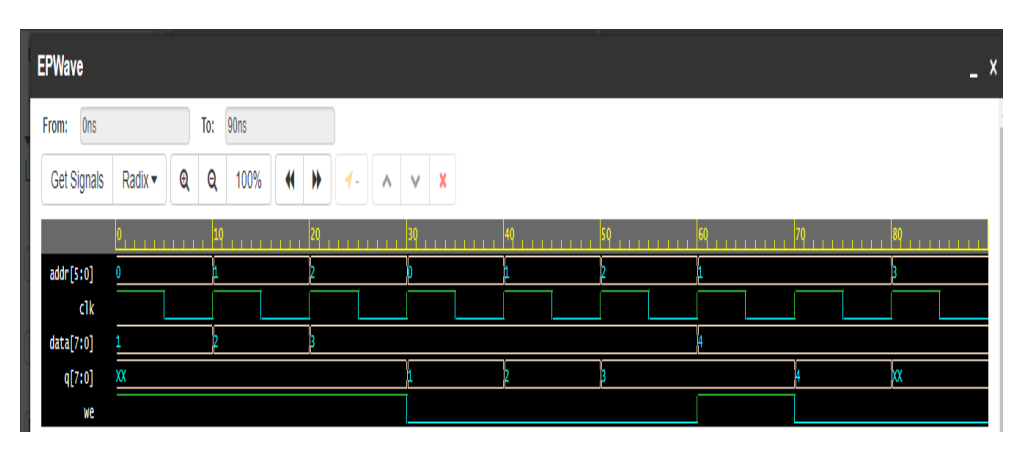
Figure 4. Waveform of read & write of Single Port RAM